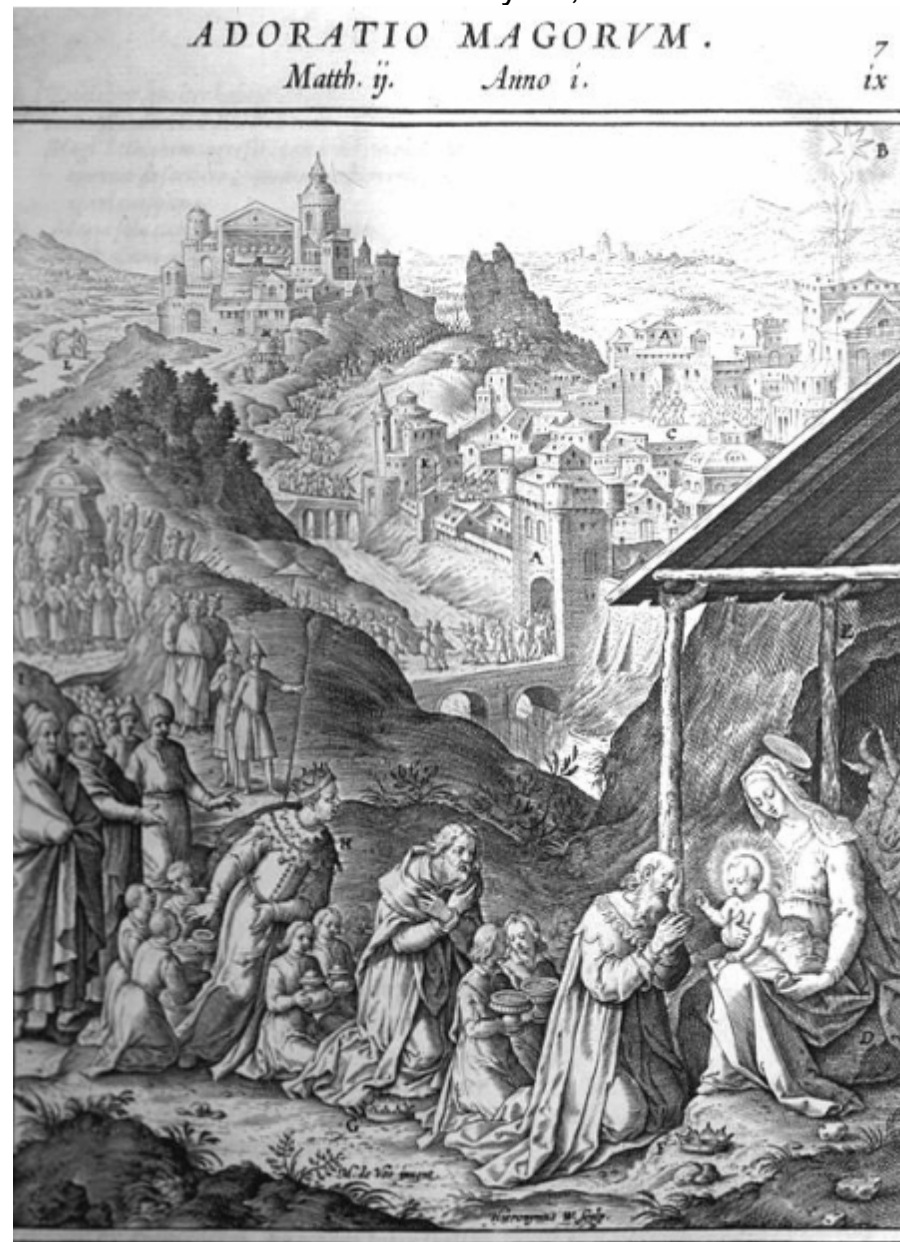
From "Illustrations of Gospel Stories" Jerome Nadal – Luke 2 – Epiphany1: Magi, Wise men from the East visit Jesus in (a house in) Bethlehem.